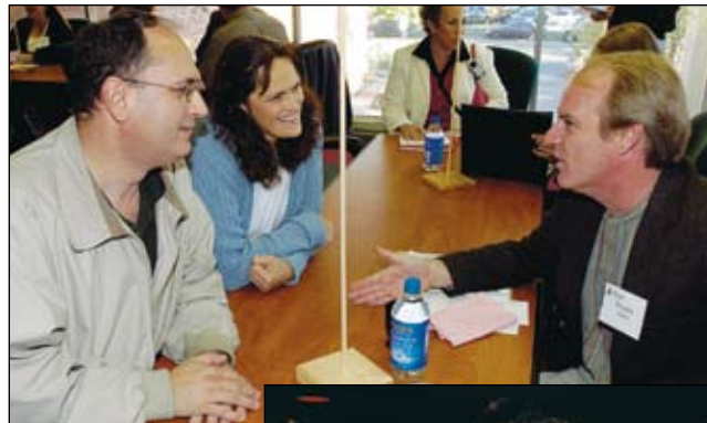
Parent Weekend provides a great opportunity to talk with your student's professors, meet other parents, and perhaps even introduce your younger children to all that Hillsdale College has to offer (like chocolate-covered strawberries!).

resources comprise the College's annual operating budget. Meeting our Founders Campaign goal of ending one-half of the current operating budget reflects the College's self-reliance and ensures its commitment to independence from federal taxpayer support. The annual operating budget provides the groundwork for everything Hillsdale does, for