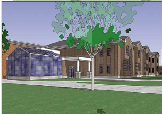
Provided Courtesy of TMP Architecture, Inc.