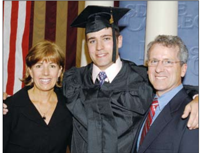
Each spring at the Commencement ceremonies, Hillsdale College celebrates the achievements of the seniors who have dedicated themselves to studying the liberal arts.

If, in pursuing our mission, we achieve a certain statistical goodness, we are grateful. On the other hand, know that we will only be successful in the pursuit of our mission