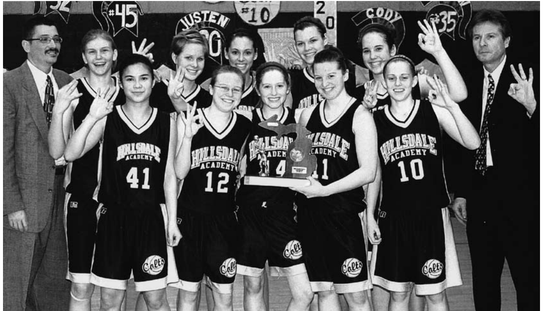
The girls' basketball team celebrates after winning a third straight district championship.