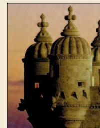
Torre de Belem, Lisbon

The capital of Portugal, Lisbon is the westernmost capital in mainland Europe. Founded as a trading outpost, it later came under Roman rule, and was taken by the Moors in 711 A.D. In 1147, crusader knights re-conquered the city.