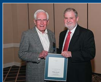
William Merrick National Leadership Seminar Seattle, Washington