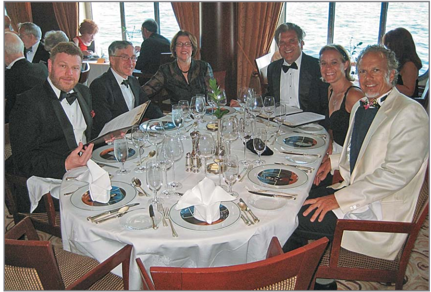
Mark Steyn (left) enjoys dinner with his fellow cruisers aboard the Crystal Symphony .

Confirmed speakers thus far include Karl Rove, Claire Berlinski, Paul Johnson, and John O'Sullivan. Mr. Johnson, who has traveled with Hillsdale several times, is a noted historian