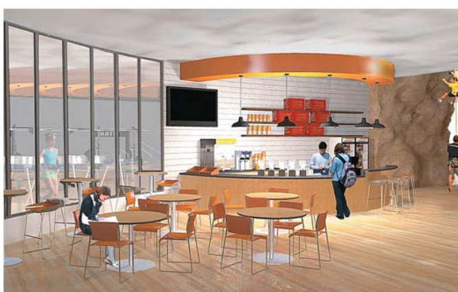
These renderings show the planned renovations to Philips Arena, including a mezzanine with a climbing wall (above) and a smoothie bar (left).