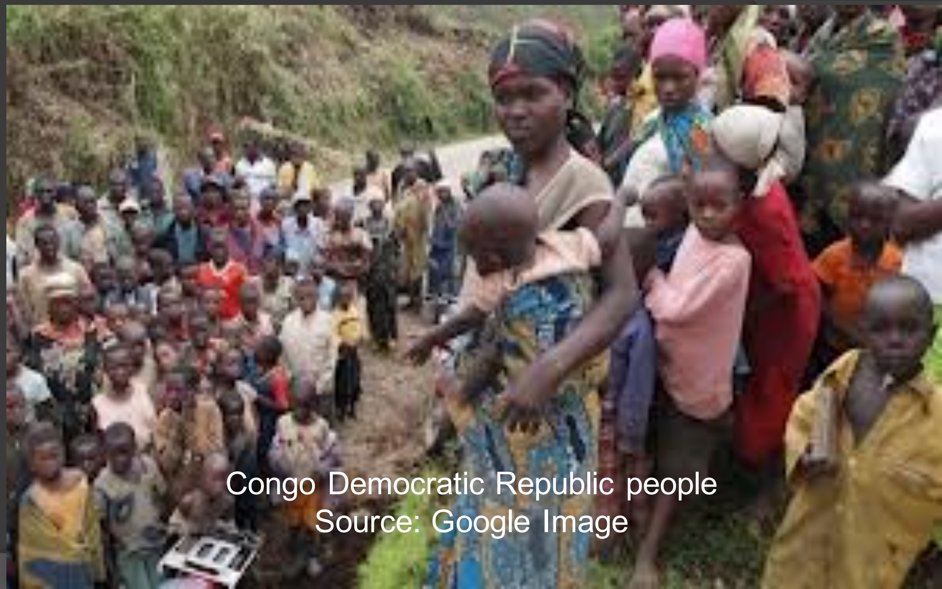
Congo Democratic Republic people