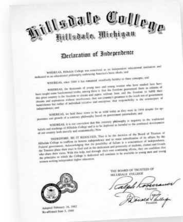
Hillsdale College's Declaration of Independence, adopted in 1962

volunteerism nurture intellectual, physical, social, and personal growth. A broad perspective is encouraged through opportunities for off-campus internships, overseas study programs, and educational programs sponsored by the Center for Constructive Alternatives, Ludwig von Mises Lectures in free market economics, National Leadership Seminars, and the Hoogland Center for Teacher Excellence. Hillsdale also publishes Imprimis , its national speech digest, with a readership exceeding 3.7 million.