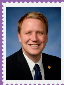
ARIC NESBITT, '01 Michigan Lottery Commissioner, Former House Majority Floor Leader of the Michigan House of Representatives