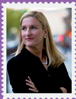
RUTA SEPETYS, '89 New York Times Bestselling Author